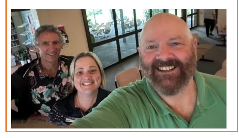
St Paul's Anglican Community, Manly gathers for worship every Sunday at 9.30am in the Chapel, Lota House 162 Oceana Terrace, Lota. We welcome you!

Have a look inside for more details of the our Sunrise Easter celebration