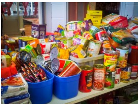
A number of bayside businesses contribute to Rosies' mission. As a founding partner, Iona College has a strong commitment to Rosies as well.