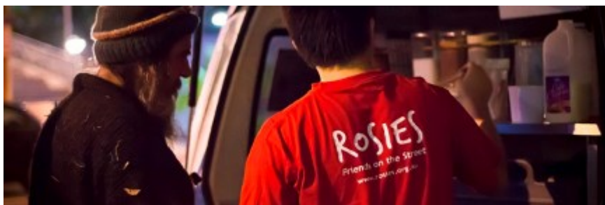
A simple cuppa and a chat with people from all walks of life.