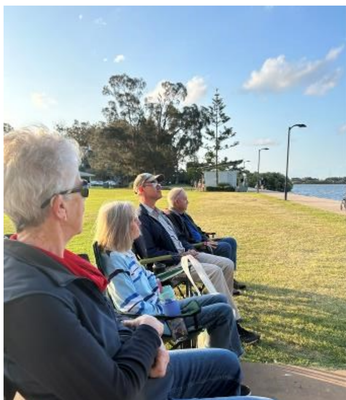
Feel the serenity!! Seriously serene seekers staring at the sea and seeing God's hand in all that is. God is indeed great!