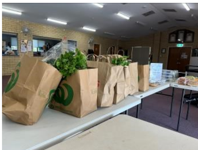
Pete's Pantry volunteers Terry and Kay with the newbie; and Bags of donated fresh vegetables and baked goods ready for distribution.